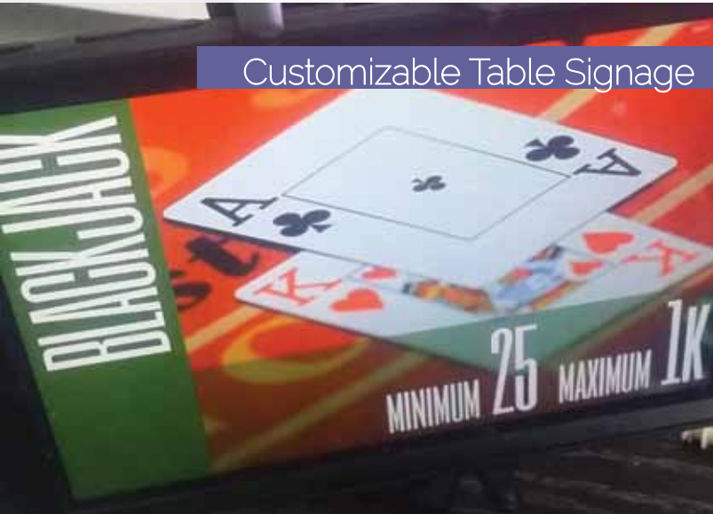
Customizable Table Signage